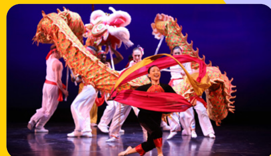
Nai-Ni Chen Dance Company