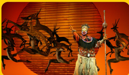
Disney's The Lion King